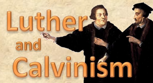
Image and Reception of Martin Luther in the History and Theology of Calvinism

International Conference of the Johannes a Lasco Bibliothek, Emden organized as a RefoRC project